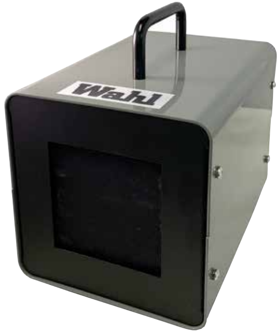
HSB50 Skin Temperature Calibration Unit

Specifications subject to change without notice.